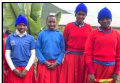
Some of the girls WTWT are funding at Secondary School