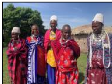
Some of the women with loans celebrating their successes with their businesses